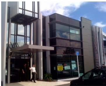
ComputerCare Hawkes Bay offices