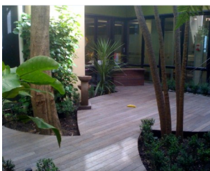
Atrium Garden at the offices

The Hawkes Bay team are all keen to get into the new premises. It is more than three times the size of the old office.