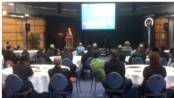
Client Event in the Napier War Memorial Centre

Its always pleasant to put on events through the regions and take the time to have a chat over some hors d'oeuvre and a wine.