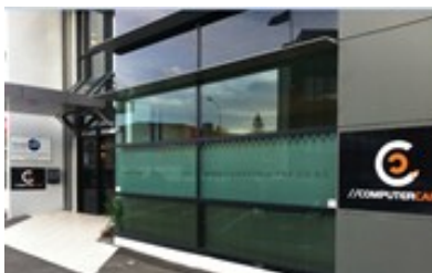
Hawkes Bay Street Presence

We look forward to hosting our first client event in our new Napier branch in the very near future.