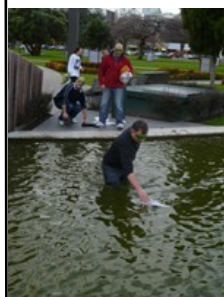
Mystery Masked Man braves duckpond

Yes the mid winter social function this year saw us out on an Amazing Race.